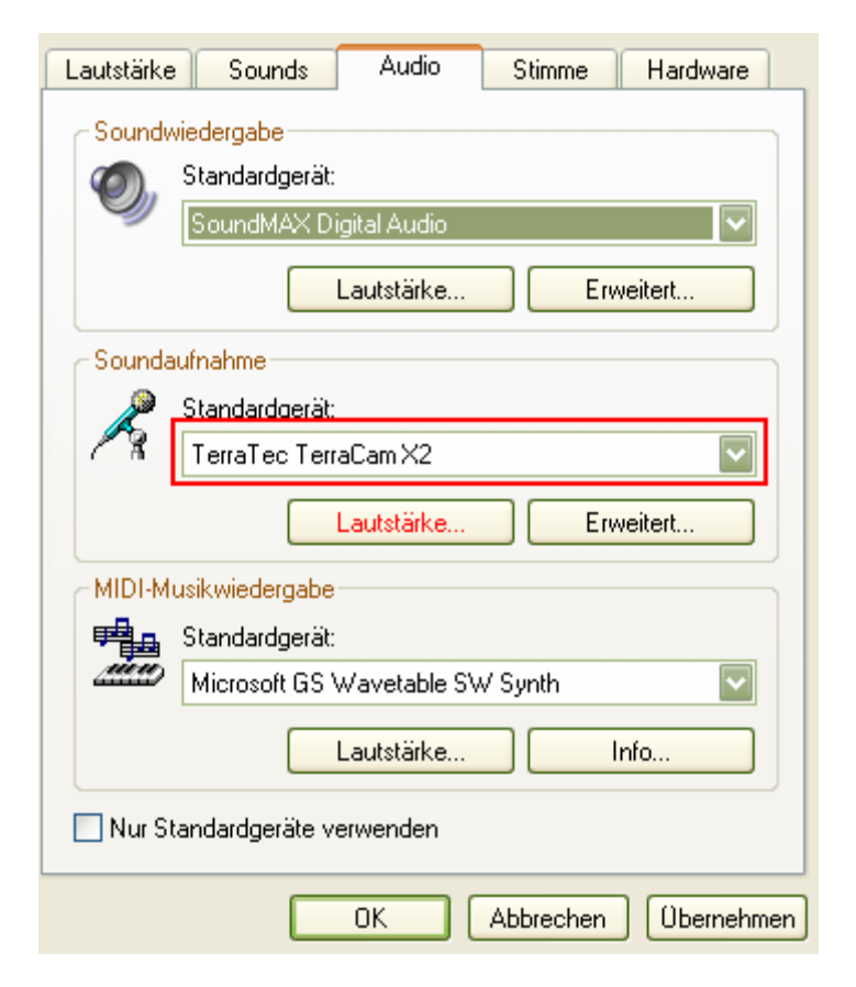
Adjusting the audio level in the Windows Mixer

The TerraCam X2 features a highly sensitive microphone. It is located at the front, just below the housing. For best results, speak toward the microphone from the front at a distance of 2 to 3 meters. If the microphone signal is not loud enough, use the Windows audio mixer to adjust the level for recording devices. Go to "Start" \rightarrow "Settings" \rightarrow "Control Panel" \rightarrow "Sounds and Audio Devices" and select the "Audio" tab. Select the TerraCam X2 (or the USB audio device) as the "default audio recording device". You can now use the "Volume" button to adjust the level of the microphone (Capture).