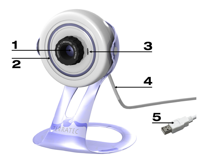
The TerraCam X2