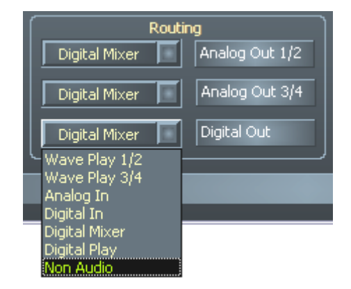
The routing options of the PHASE 24 FW