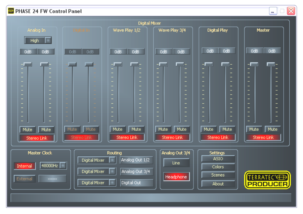
Overview of the PHASE 24 FW Control Panel.

The Control Panel is quite intuitive and should not present beginners with major problems. Nevertheless, the following section contains a number of explanations of the individual function blocks.