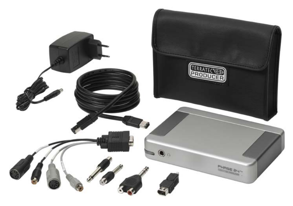
Your new audio interface: PHASE 24 FW.

Technology and design. PHASE 24 FW—the perfect external audio system for mobile use by TerraTec Producer. That's why we included a protective pouch. Fantastic specs like 24-bit/192 kHz and a versatile range of ports such as 2 IN and 4 OUT (analog, one of which is designed as a Headphone OUT with an adjustable level), digital I/O (coaxial), FireWire<sup>™</sup> port and MIDI I/O make the PHASE 24 FW an ideal tool for DJs on the road or a valuable helper in your home studio together with your laptop. And to top it all off, we've given it a stylish aluminum case. Feel free to flaunt it.