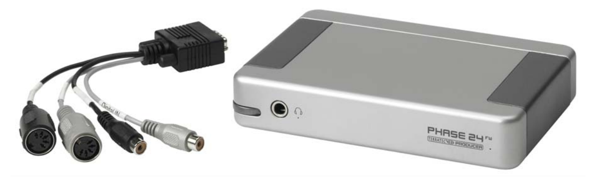
PHASE 24 FW front panel with multi-connector cable

The PHASE 24 FW audio interface offers you numerous connections for connecting professional studio peripherals and HiFi devices. Following is a detailed overview of its technical and electrical characteristics: